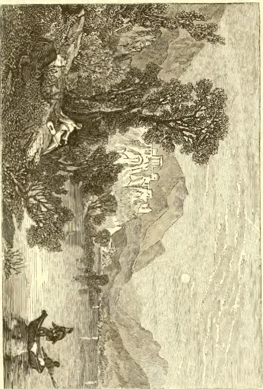
“A TINY BARK WITH MUFFLED OAR— THE MAIDEN WAITS UPON THE SHORE.”